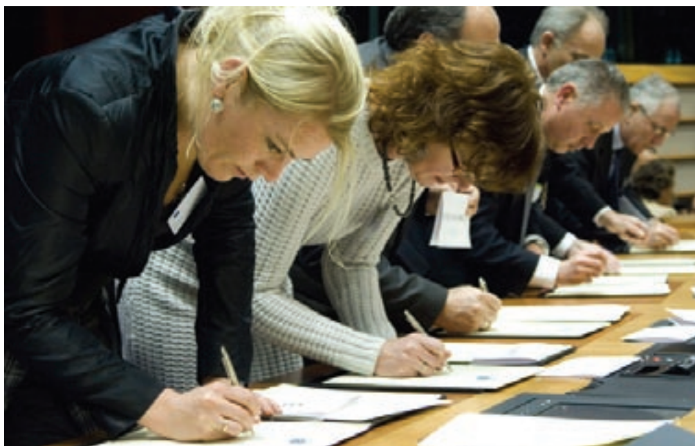
Coming together to make the commitment: Mayors from participating cities sign the Covenant at the First Ceremony in Brussels, 10 February 2009.